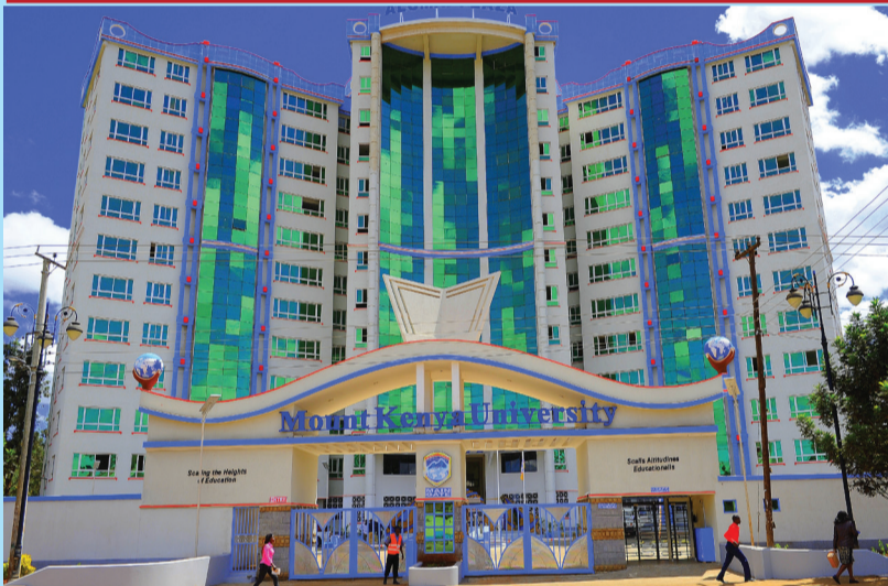
The magnificent Alumni Plaza