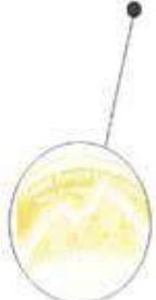
INVISIBLE FLUORESCENT INK

with all rights and privileges thereunto appertaining, in witness whereof we have affixed our signatures and the seal of the University