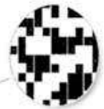
2-D BARCODE with: Name, Award, Course, Year, & Serial No. encrypted