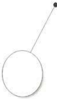
PARACHUTE WATERMARK PAPER

Upon the recommendation of the Senate and the authority of the University Council, hereby confers upon