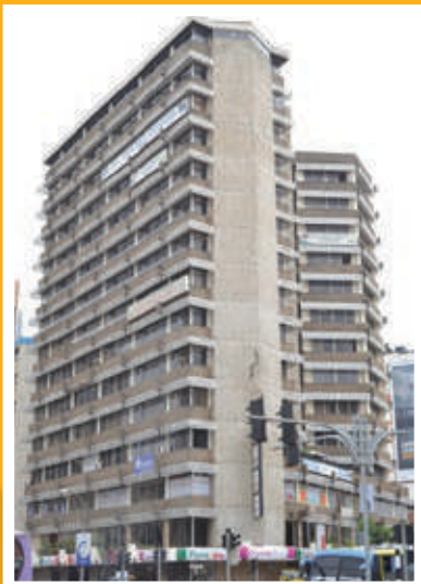
Union Towers - Nairobi Campus