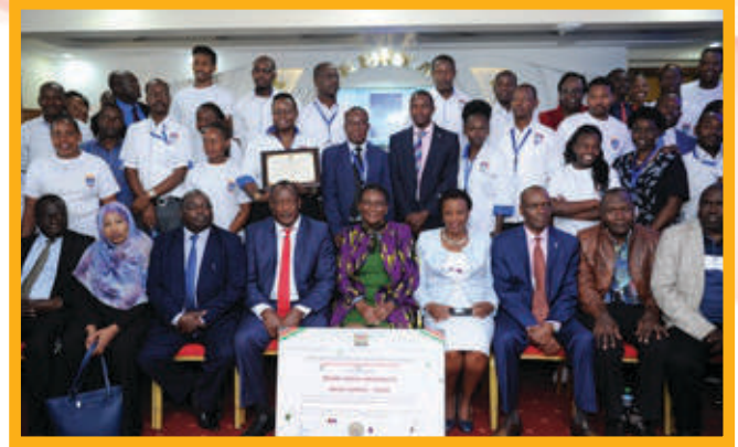
Mount Kenya University receives accreditation certificates for Bachelor of science in Environmental Health programme. MKU is the first University to be accredited by Ministry of Health in Bachelor of science in Environments programme