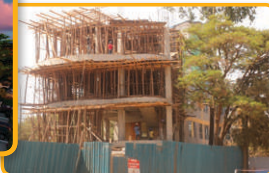
Snap shot of the work on progress at the Main Campus, Thika library. The Expansion will increase the library capacity more so the e-sector and have a dedicated centre to server the post graduate students