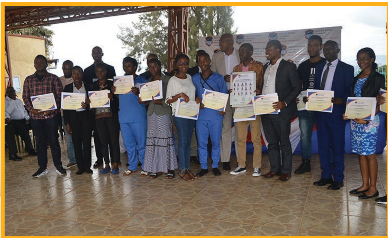
Students enter Mount Kenya University Rwanda Wall of Fame in recognition to their excellent academic performance