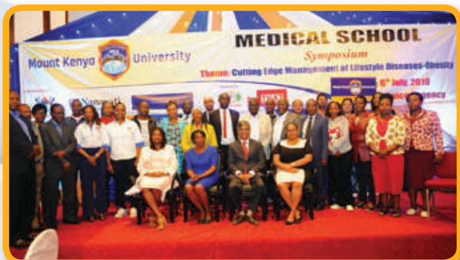
A quick glance of the participants who attended the a symposium on "Cutting Edge Management of Lifestyle Diseases- Obesity" the event was organized by MKU Medical School. Presenters were drawn from Kenya, India and Uganda