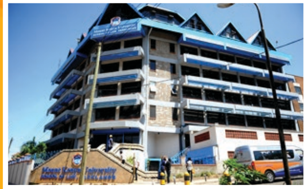
Parklands Law Campus