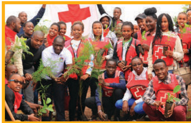
Mount Kenya University students and staff join Kenya Redcross staff in marking world environmental day by planting tree at the botanical garden in Landless, Thika