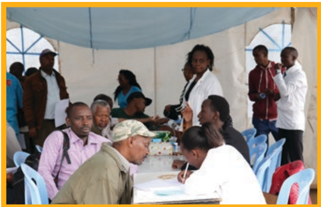
Members of public been attended to during MKU sponsored Cancer Medical Camp which was organized at Thika Main Campus