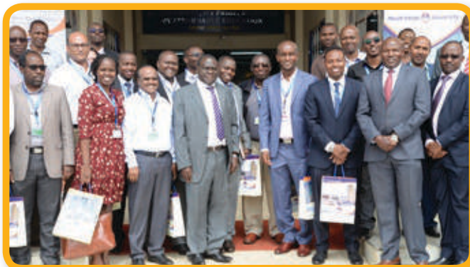
Mount Kenya University through the Directorate of MKU Foundation organized a successful breakfast meeting with 20 industries under the umbrella of the Kenya Association of Manufacturers, Central Region chapter on 21st February 2019 at MKU Thika Campus. Above is a group photo of some of the participants outside MKU alumni plaza