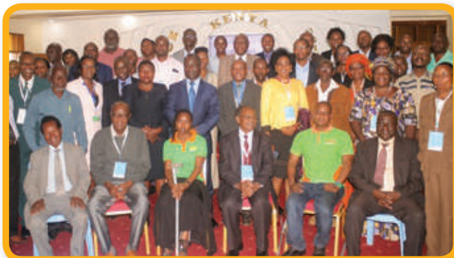
Delegates who attended African Sport Management Association's 4th International Conference which was hosted by MKU take a group photo. The Conference attracted delegates from Kenya, Nigeria, Uganda, Gambia, Germany, Zimbabwe and Burundi