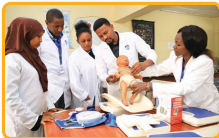
MKU College of Health Sciences students in one of their sessions in the newly launched environmental skills lab