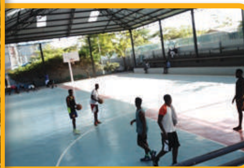
“All work and no play makes Jack a dull boy”. An ultra modern basket ball pitch with an anti-fatigue epoxy floor, high roof, natural cooling and floodlights. At MKU we nurture students’ sports talents