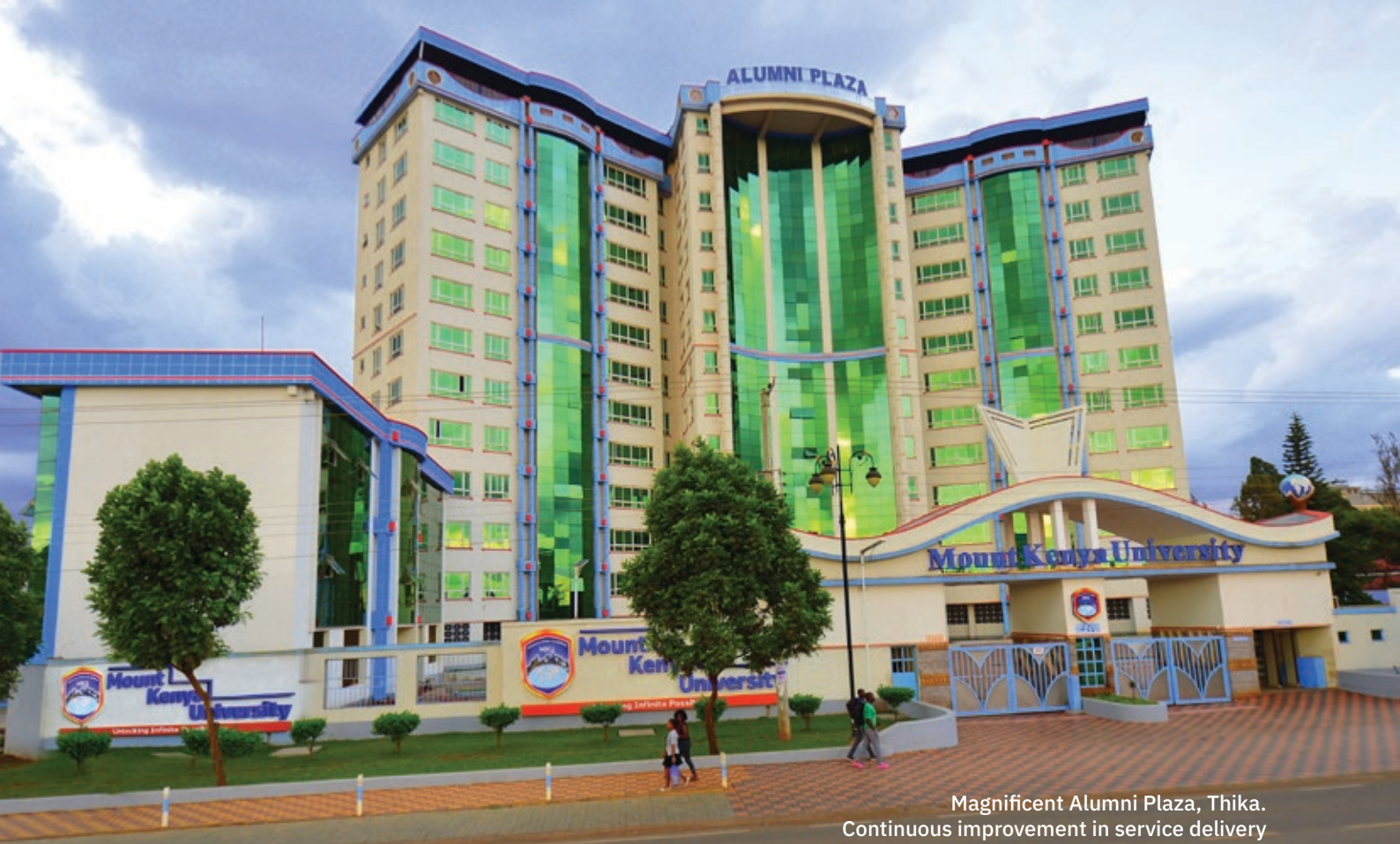
Magnificent Alumni Plaza, Thika. Continuous improvement in service delivery