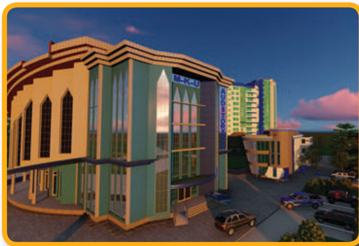
An artistic impression of the Convention Centre currently under construction at Main campus (Thika). Once complete the facility will be hosting conferences aimed at disseminating research findings