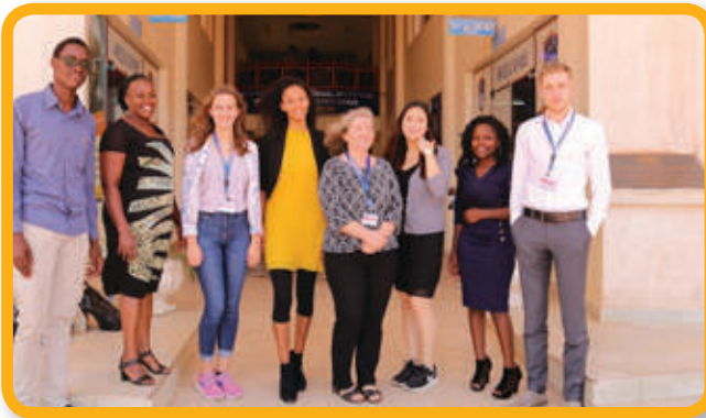
MKU and BRSU University, Germany students during an exchange program