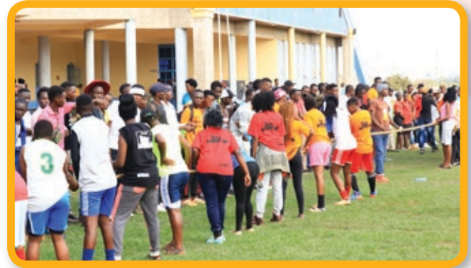
Students prepare to engage in a tug of war during yearly sports day dubbed "Supa Sato"