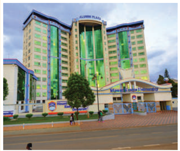
Thika Main Campus