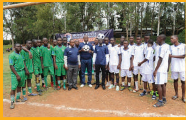
A moment during the Mount Kenya University Rwanda sponsored inter-secondary schools tournament held at Kagarama secondary school early this year. MKU support talents in your people