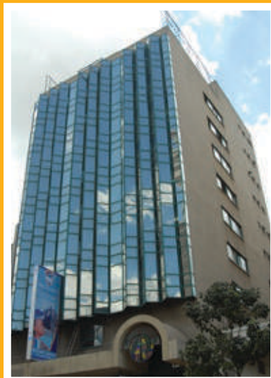
MKU Towers - Nairobi Campus