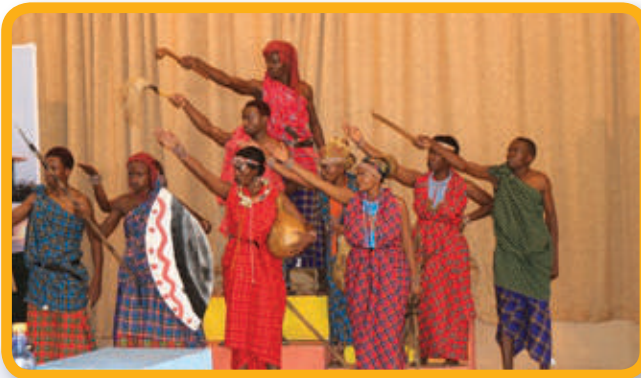
Students participating in a drama festival