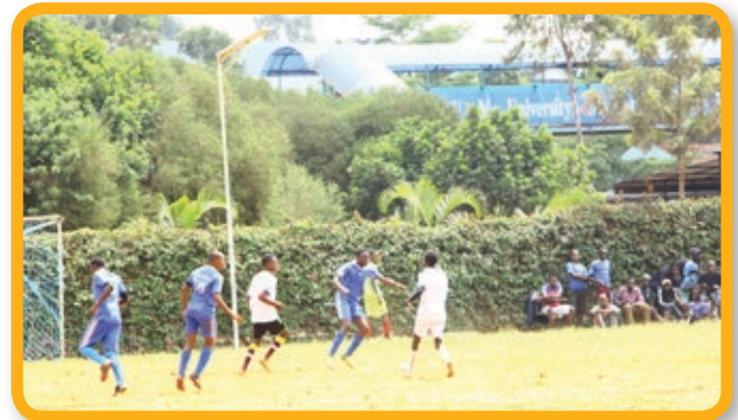
MKU students participating in the highly-contested internal football league