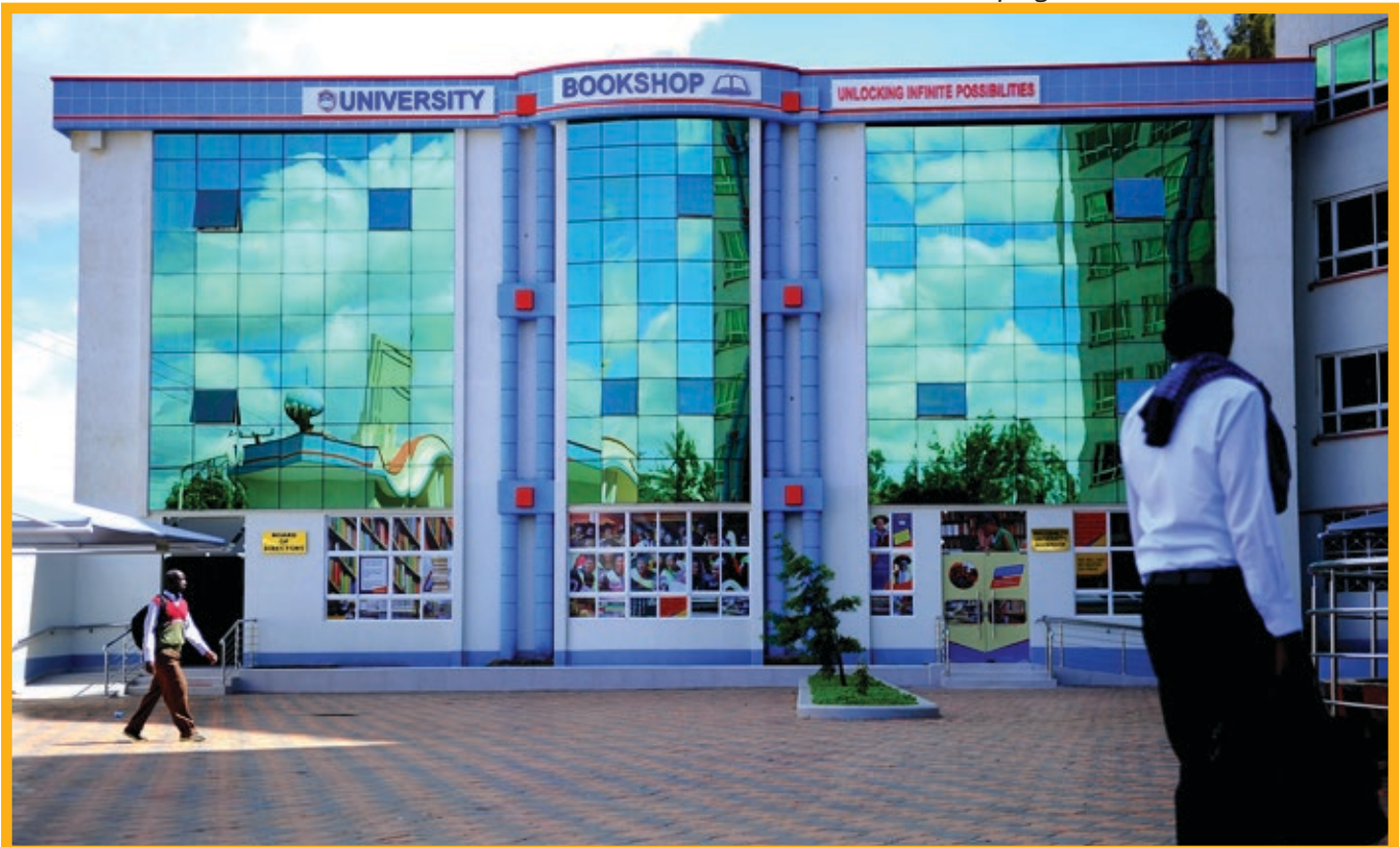
Mount Kenya University's State-of-the-art eclectic and well-stocked bookshop that will quench your knowledge thirst with rare, rich and expensive book/journal releases. The Bookshop is also your one-stop-shop for MKU-branded merchandise and give-aways