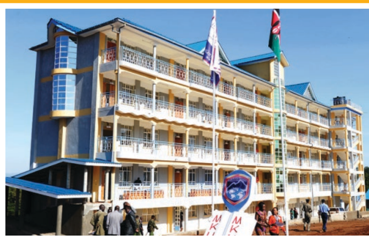
Kitale ODEL Centre