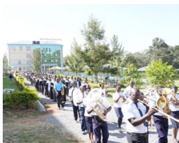
Graduands procession during 2nd graduation ceremony, December 2023.