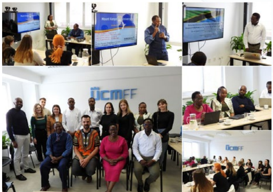
Participants during the international workshop held at the UCM, Slovakia.

on improving research ethics for quality research output.