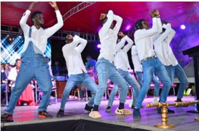
MKU Dancers perform during the MKUSA Inauguration ceremony.