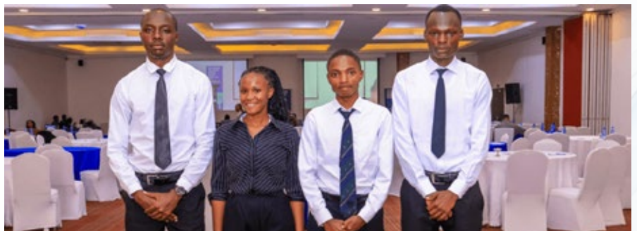
Mount Kenya University students from Thika main campus. The team had three groups.