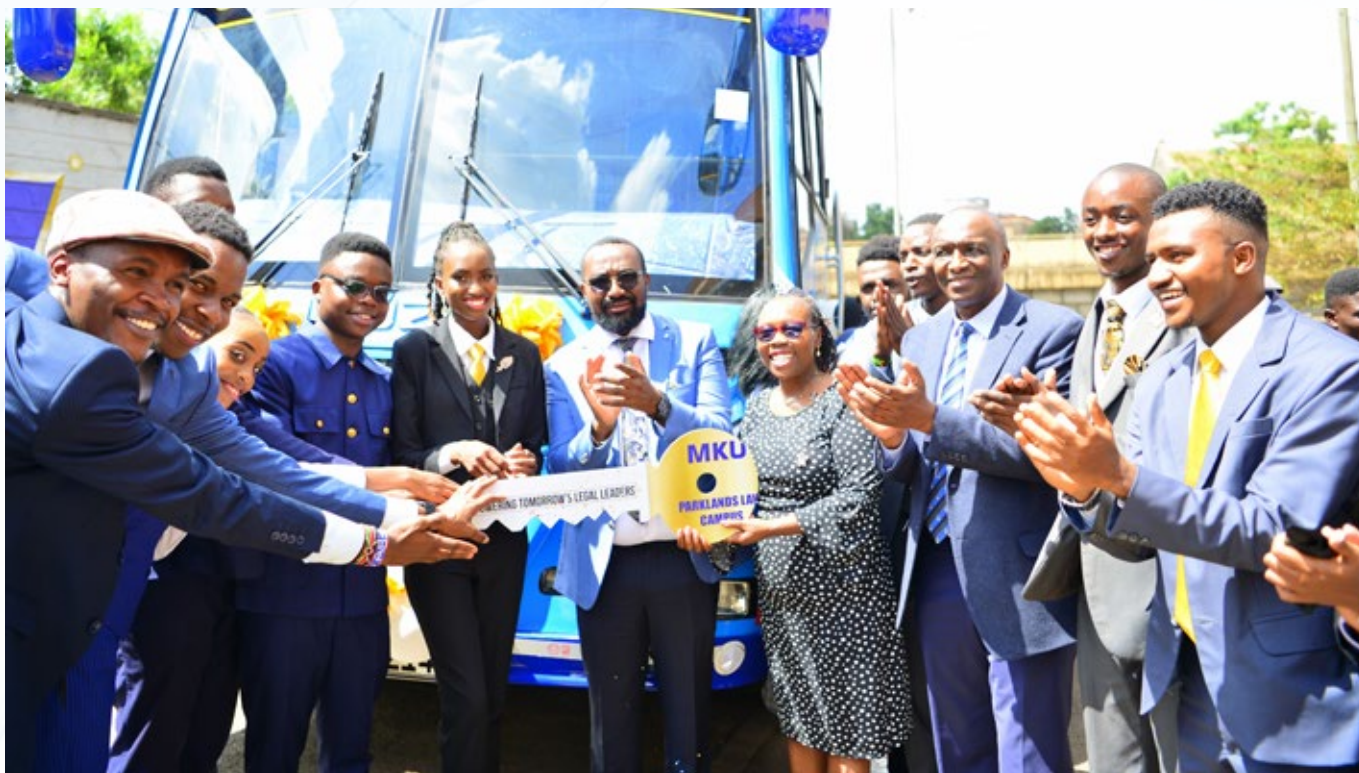
MKU School of Law staff and students celebrate after receiving their new bus.

In a significant boost to students' welfare initiatives, MKU Parklands Law Campus has increased its fleet by acquiring a dedicated bus to support academic field trips and extra-curricular activities. The move comes as a response to the campus's expanding student population, which has seen a steady rise in numbers over the past few years. The acquisition of the bus addresses the pressing need for reliable transportation to support various academic and extracurricular