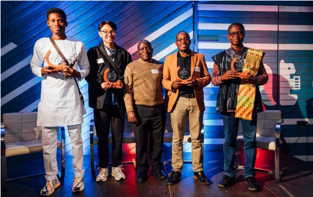
Awarded Participants at Born Global Award Africa 2024.

The African German Entrepreneurship Academy Business Idea competition focused on engaging Science and Technology based start-ups with prototypes based on research conducted at Higher Education Institutions. Mount Kenya University Researchers submitted two business concepts for Exist proposal (Eco Trace - Refill & Reuse Model Powered by Digital Passports and Wema herbal bathing black Soap).