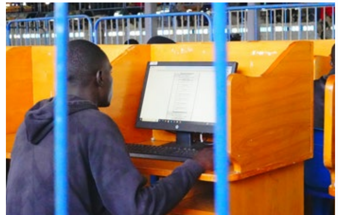
A student delegate exercising his mandate as a voter. (The university prides itself on conducting an e-voting).