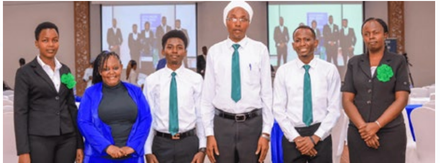
Mount Kenya University Nakuru Campus students during the CFA Research Challenge.

Mount Kenya University managed to have two teams compete in the final round out of the three teams drawn from the Thika and Nakuru campuses. Other Universities that participated include; Strathmore University, Jomo Kenyatta