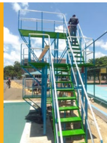
Training facilities at Maritime Academy, Malindi.