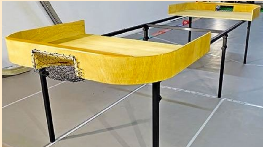
Improvise showdown table - A skeleton of an Improvised Showdown Table.