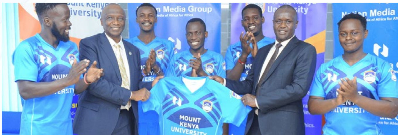
Mount Kenya University Tigers Rugby club players and officials celebrating after receiving the sport kits.