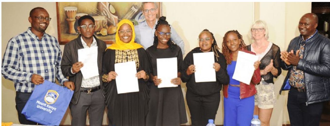
Mount Kenya University first cohort of five students celebrates after receiving their apprentice contracts.

M ount Kenya University has sent the first cohort of five students to Germany to offer healthcare services in the European country. The graduates were presented with their work permits, visas, and air tickets, all fully funded by Caritas Hospital (Germany), one of the project's partner institutions in Germany. The partnership between MKU and Hochschule Koblenz University of Applied Sciences of Germany offers paid apprenticeships and jobs to young Kenyans. Students interested in the opportunities are required to have German Language proficiency and pursue a preparatory programme in Nursing apprenticeship for German hospitals.