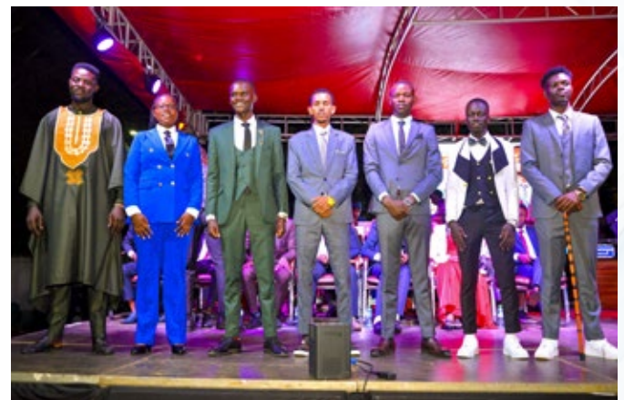
The 2024/25 MKUSA cabinet members pose for a photo after taking the oath of office.