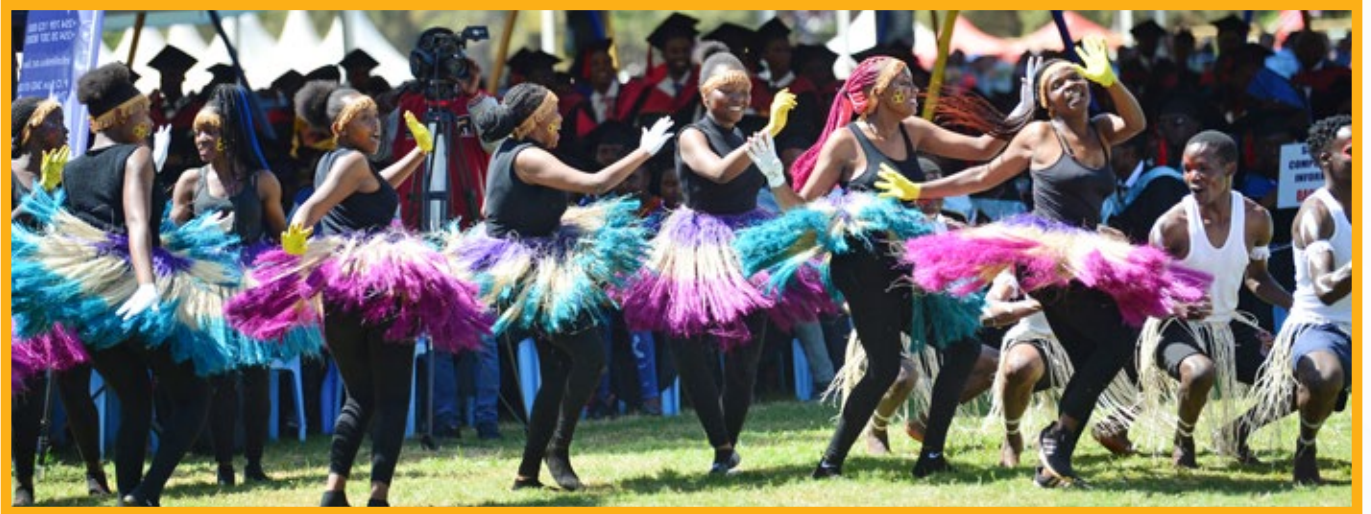
Cultural dance-students performing during a past graduation ceremony.