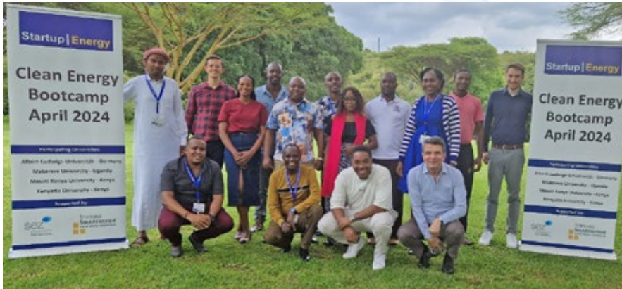
Participants of the bootcamp pose for a group photo.

S tartup|Energy a joint initiative of Stiftung Solarenergie (Germany) and the University of Freiburg sponsored a clean energy boot camp in Nairobi from 10 th -15 th April 2024 for selected universities in Uganda, Kenya and Germany. The following four universities were involved in the boot camp: