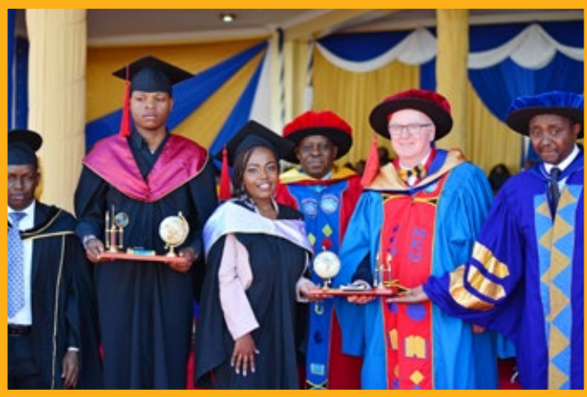
Vice-Chancellor's Merit Awardees.