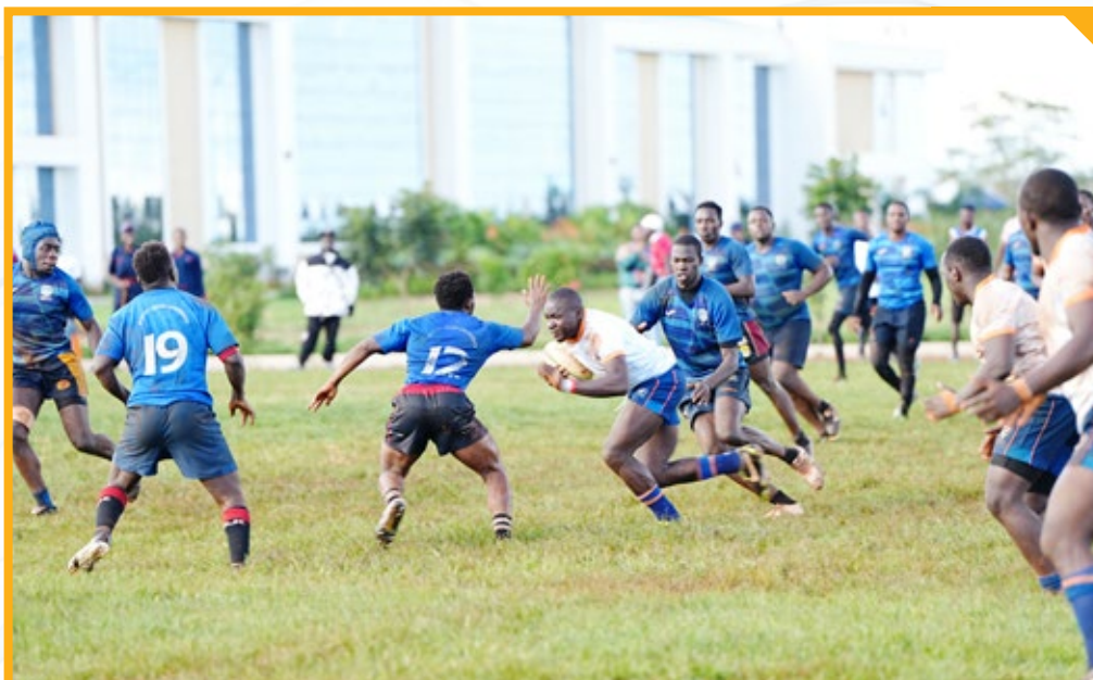
Mount Kenya University Titans rugby team players (in blue) battling it out with Zetech University players (in white) during the Kenya Rugby Central Region playoffs.

Let all with one accord In common bond united Build this our nation together And the glory of Kenya The fruit of our labour Fill every heart with thanksgiving.