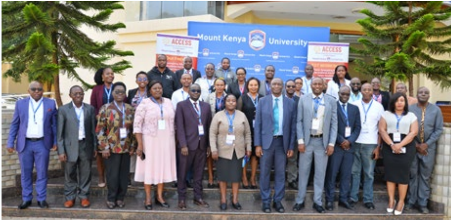
TOT participants (Industry and Academia) at Mount Kenya University.

The ACCESS Training of Trainers (TOT) Workshop, held in 2024, brought together participants from nine local universities and small-to-medium enterprises (SMEs) to address the pressing need for stronger University Business Linkages (UBL) and improved career enhancement strategies. The workshop aimed to bridge the gap between academia and industry, focusing on how to better prepare students for the job market.