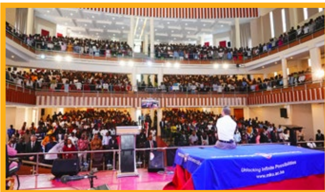
Nick Vujicic delivers a sermon during his visit to the University.