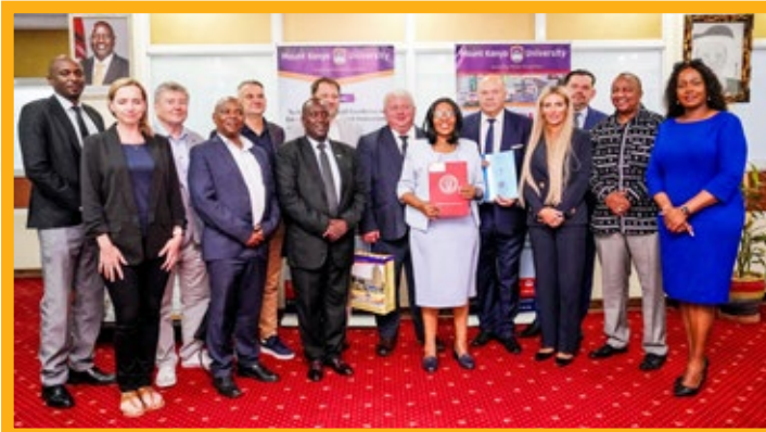
The joint delegation from the Polish Chamber of Commerce, Kenya National Chamber of Commerce and Industry (KNCCI), also representing the University of Bialystok in Poland who visited Mount Kenya University (MKU) on 15th July 2024 and discussed possible areas of collaboration.