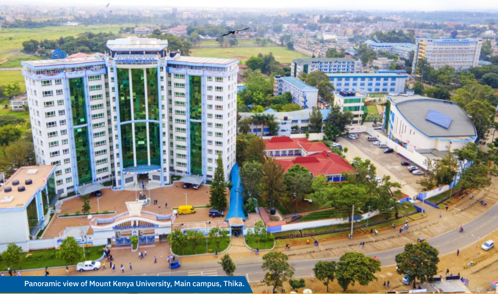
Panoramic view of Mount Kenya University, Main campus, Thika.