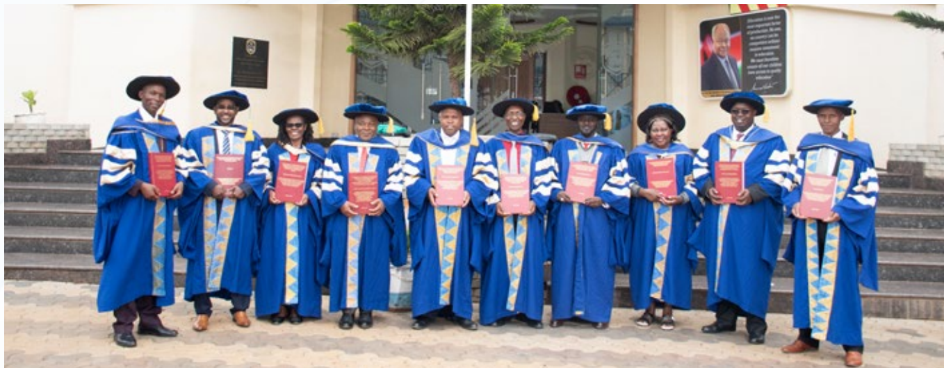
Some of the PhD graduates for the 25th Graduation ceremony.