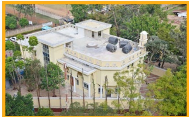
Expansion of Mount Kenya University Mosque, Main campus Thika.