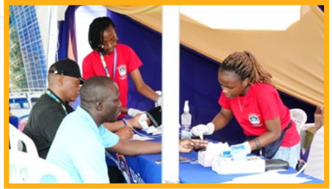
Students from the College of Health Sciences offer health checkup services to the principals during the annual Kenya Secondary Schools Heads Association conference, 2024. The school of Law also offered free legal clinic to the conference participants.