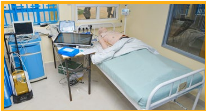
A high fidelity mannequin for practice at the nursing skills lab.