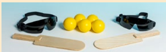
Accessories - Wooden bats, synthetic opaque protectors and showdown balls.

Through its patron, MKU Foundation ensures students with special needs of continuous support as they engage in various curricular and co-curricular activities that'll enable them actualize their dreams.