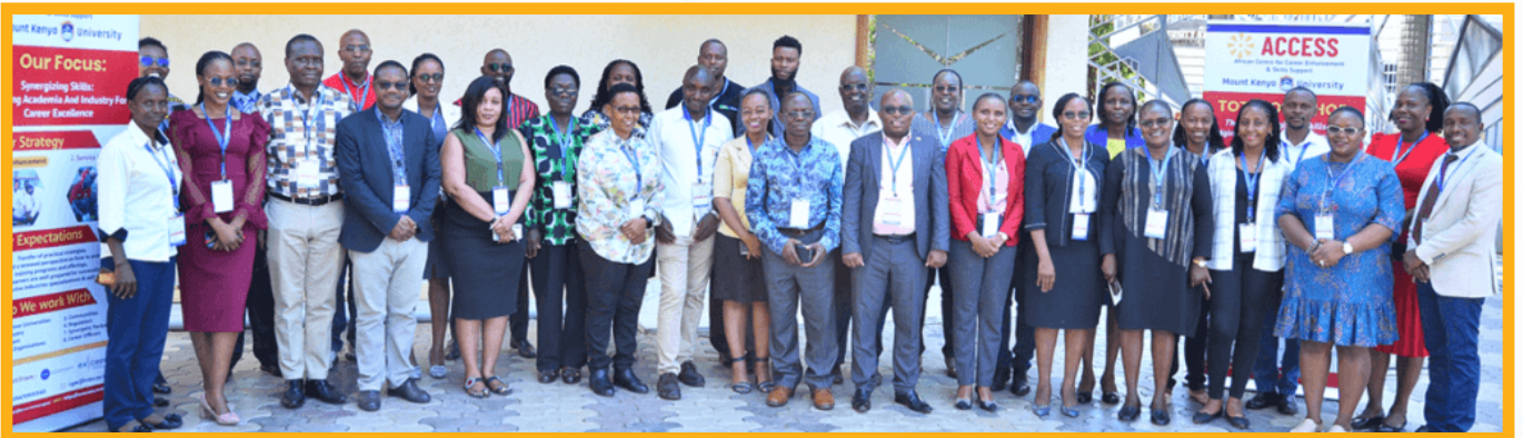
ACCESS TOT Workshop at Mount Kenya University to discuss the Service-Learning Framework and development of Common Entrepreneurship Curriculum to be rolled out in 10 Local Universities.