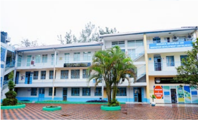
Research and Innovation facilities, Housing the Innovation Hub, Malaria Research Centre and the university Research centre.

M ount Kenya University innovation and incubation Centre was recently named among the Top 8 innovation hubs in country that won a highly competitive grant to nurture MSMEs across the country and also implement its own performance improvement plans. This culminated in the university signing a grant agreement with the Ministry of Investments,