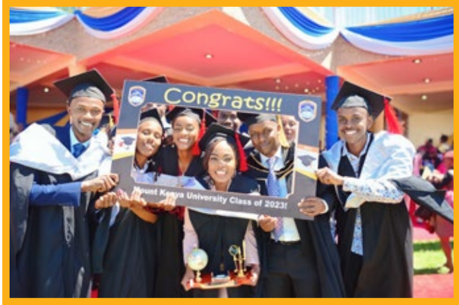
Happy graduands celebrate with their awards.