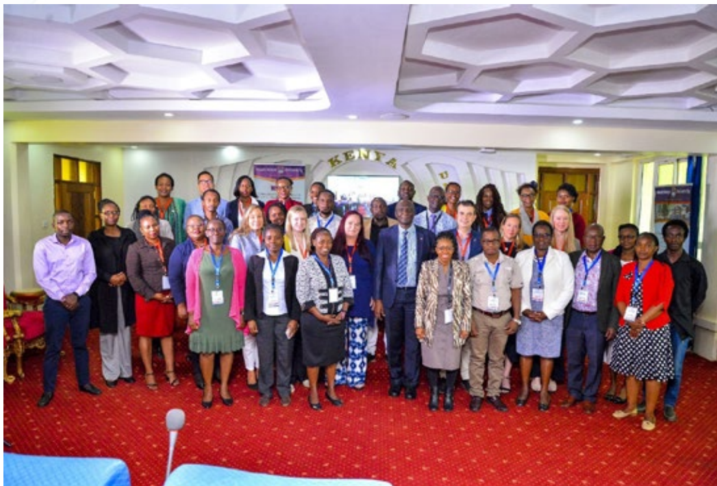
Group photo of Mount Kenya University, Vice-Chancellor and symposium participants.