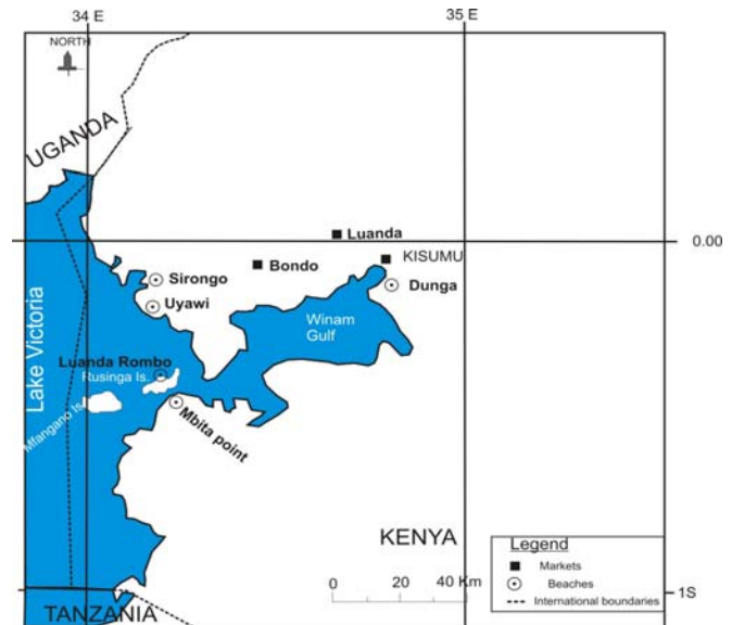
Fig. 1 A map of Winam Gulf of Lake Victoria showing the sampling sites

Using a cross-sectional study design, water (250ml per sample in sterile bottle) and one kilogram of fresh fish samples (500-600 pieces of Rastrineobola argentea ) and whole fresh Oreochromis niloticus , respectively, were randomly collected from the fish landing beaches and from the markets and placed in sterile plastic bags. Within each fish landing beach, or from each market, the samples (whether water or fish species) were taken from three different locations, and at each location, samples were taken from three different points, meaning that nine (9) samples (whether water or fish) were taken from each fish landing beach or market.